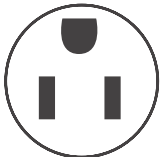
Plug Type (NEMA) 5-15P

1 Warranty 5 year sealed system/1 year full parts and labor.