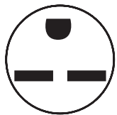
*Plug Type (NEMA) (D) 6-30P

NOTE: For planning purposes only. Always consult local and national electric codes. Refer to Product Installation Guide for detailed installation instructions on the web at frigidaire.com .